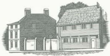
The Paul Revere Memorial Association

It is part of a complex of national landmark structures, owned and operated by the Association, that reflect three centuries of domestic history, while serving as a significant educational resource for learners of all ages.